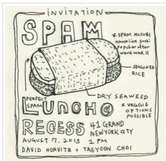
Spam Lunch at Recess

A window display with the promise of a "Spam Lunch Free" was advertised on Grand Street between Thompson and West Broadway in Soho on August 7, 2013. This artistic display was created by David Horvitz , a watercolor painter and photographer & Taeyoon Choi , an artistic technologist. In collaboration, the performance art exhibit was created as part of the finale of In Search of a Longitude , David's two-month exhibition at Recess.