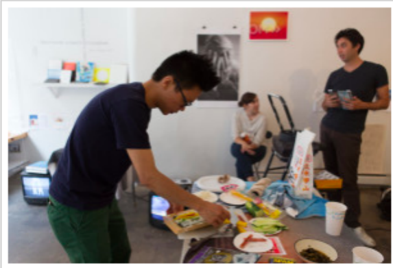
Prepping for Spam Lunch Project