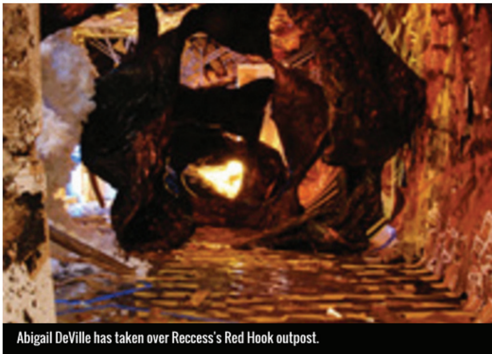
Abigail DeVille has taken over Recess's Red Hook outpost.